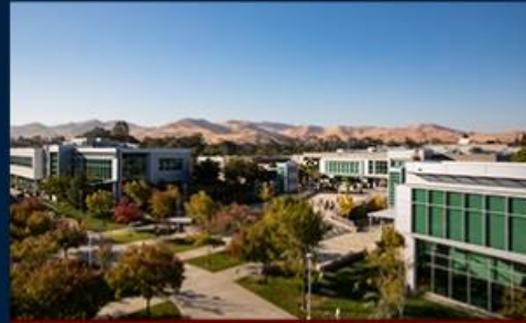
LOS MEDANOS COLLEGE