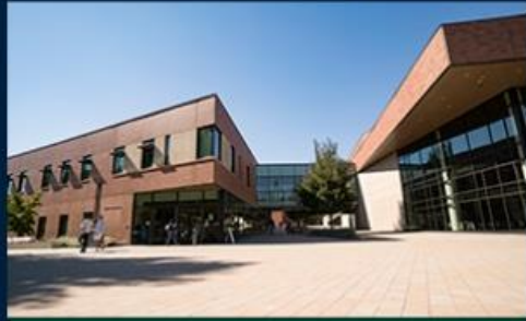
DVC DIABLO VALLEY COLLEGE