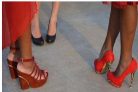
Figure 14.1.1: high heels

Amari loves wearing high heels when they go out at night, like the stiletto heels shown in Figure 14.1.1. Amari uses gender-neutral pronouns, such as they, them, and their. They know high heels are not the most practical shoes, but they like how they look. Lately, Amari has been experiencing pain in the balls of their feet—the area just behind the toes. Even when they trade heels for comfortable sneakers, it still hurts when they stand or walk.