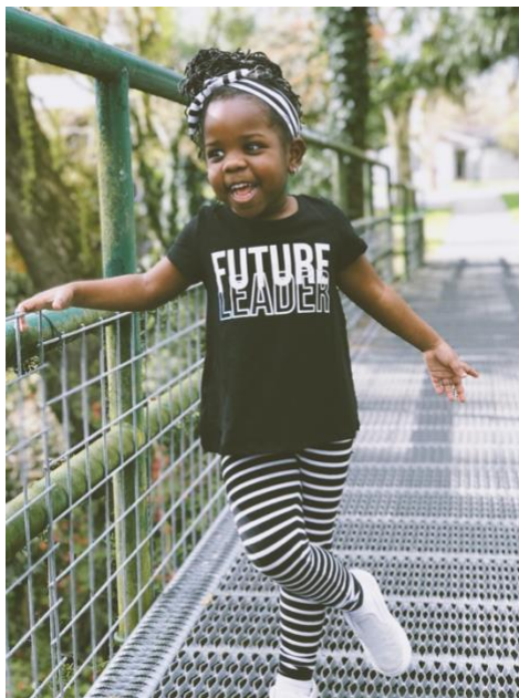
"International Business Day"

A special thanks to the team that was convened in the summer of 2021 to create the IDEA Framework and the workgroup that was established in partnership with RIOS in the summer of 2022 to further refine the Framework and expand the availability of STEM-specific resources.