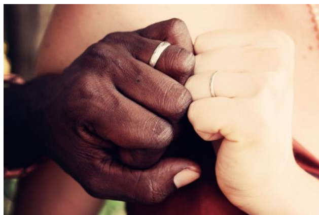
"Newlyweds wearing rings" by Désirée Fawn on Unsplash

The Framework is intended to be applicable to all disciplines and accessible to all faculty. While the goal is to facilitate an in-depth and comprehensive analysis of resources, elements that are more superficial in nature were included to provide explicit approaches to improving resources. The ASCCC OERI hopes that the Framework will encourage faculty to not only address issues of inequity in academia but also promote a transformative reconsideration of how we know what we know and how education has been shaped by those who have been historically recognized as the experts.