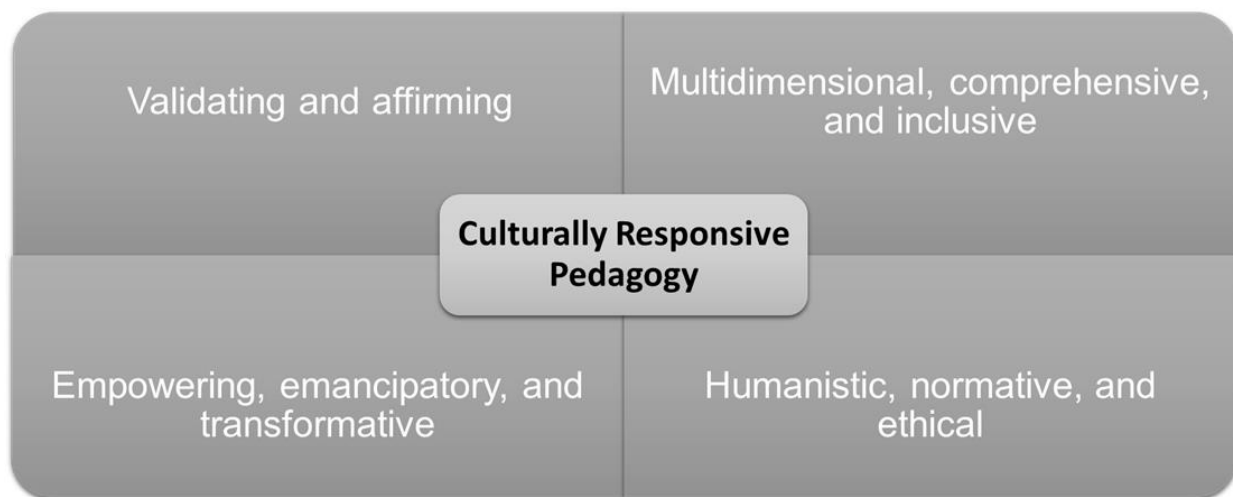
Figure 1. Characteristics of culturally responsive pedagogy.

According to Geneva Gay (2018), culturally responsive pedagogy, or culturally responsive teaching, has the following defining characteristics that support student learning and development (Figure 1).