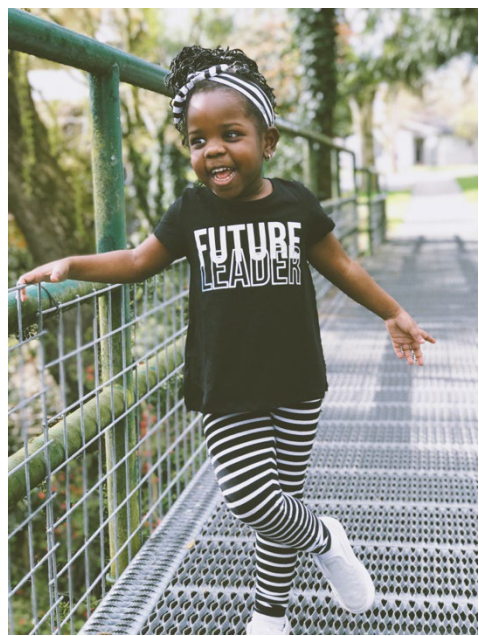
"International Business Day"