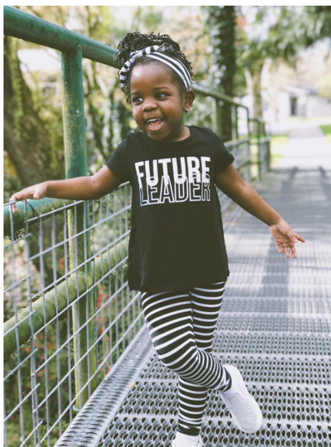
"International Business Day"