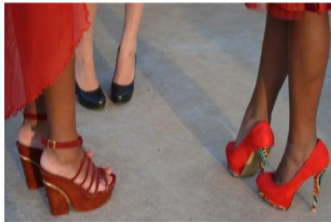
Figure 14.1.1: high heels

Amari loves wearing high heels when they go out at night, like the stiletto heels shown in Figure 14.1.1. Amari uses gender-neutral pronouns, such as they, them, and their. They know high heels are not the most practical shoes, but they like how they look. Lately, Amari has been experiencing pain in the balls of their feet—the area just behind the toes. Even when they trade heels for comfortable sneakers, it still hurts when they stand or walk.