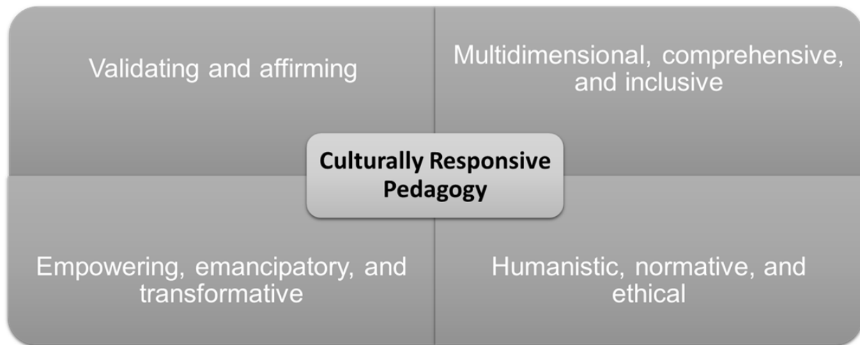
Figure 1. Characteristics of culturally responsive pedagogy.

According to Geneva Gay (2018), culturally responsive pedagogy, or culturally responsive teaching, has the following defining characteristics that support student learning and development (Figure 1).