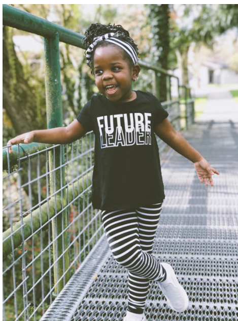
"International Business Day"